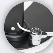
Security Cable with Key