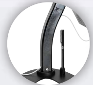
Cable Routing System