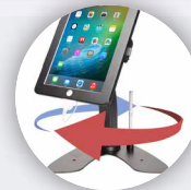
Rotates 360 Degrees