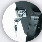
Case Lock with Key