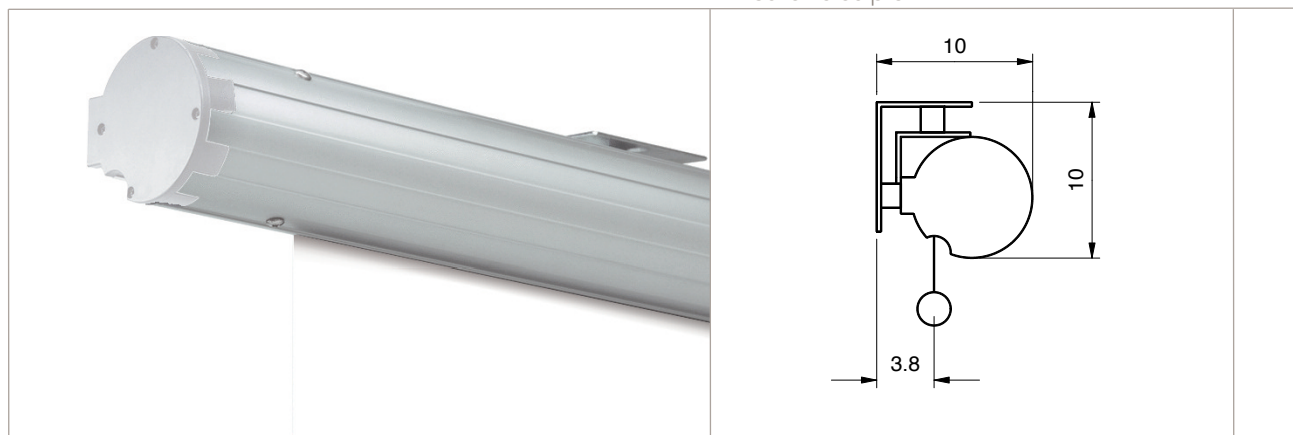
Schéma du profil